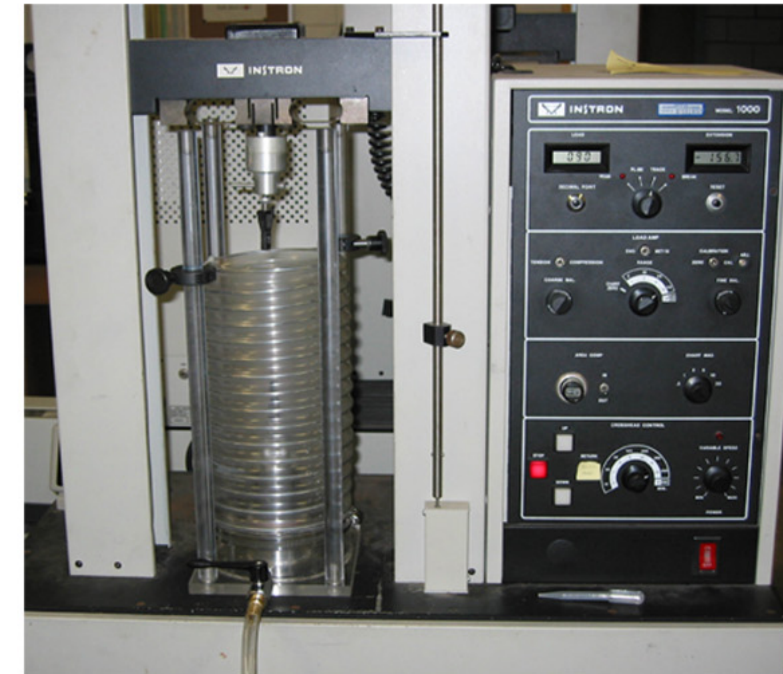
Figure 1 - Instron 1000 Mechanical Testing System with Environmental Chamber.